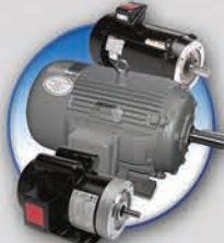
Motors and Worm Gearboxes