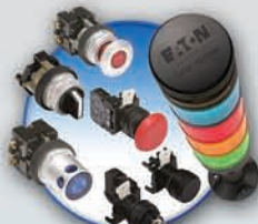
Pushbuttons, Switches and Lights