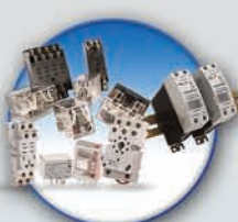
Relays & Timers