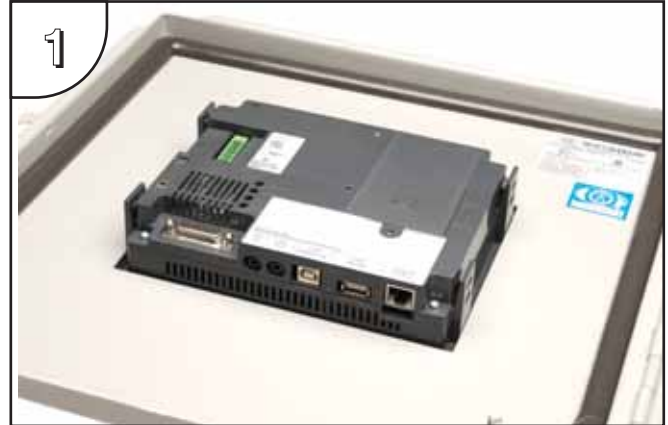
Position the touch panel through the cutout in the control cabinet door and hold in place. The mounting clips can be positioned into one of two different set of slots for different cabinet thicknesses. See table below.