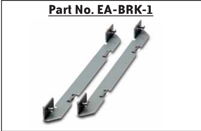
Part No. EA-BRK-1