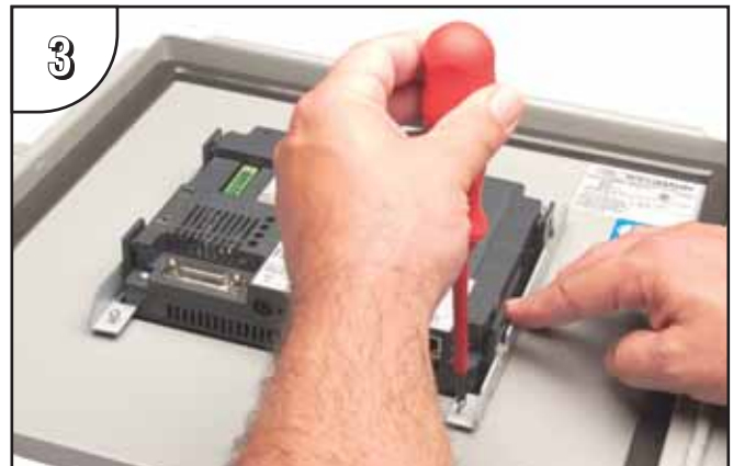
Tighten the mounting screws in an alternating fashion at four places while observing the front of the touch panel. The goal is to make sure the front bezel is pulled up against the enclosure sheet metal uniformly, and the touch panel gasket is fully compressed all away around its perimeter. Tightened the screws to a torque as shown in the table below. Avoid over-tightening the screws to the point that they start to deform or bend the mounting clip.