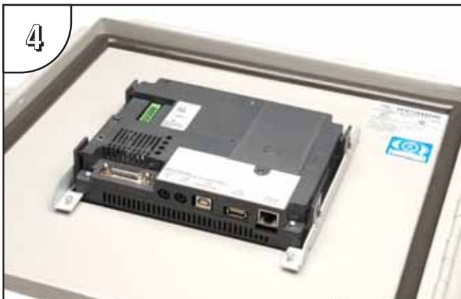
The above photo shows both mounting clips in place and the touch panel secured.