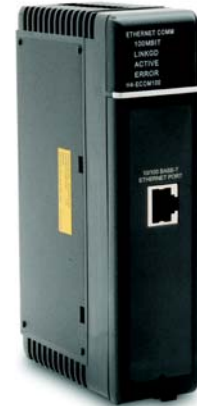
H0/H2/H4-ECOM100 modules shown