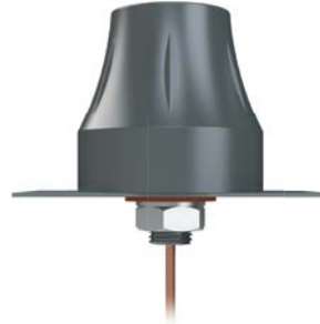
STRIDE dome 2.4 GHz WiFi antenna, IP67, panel mount, 9.8ft/3m cable length.