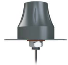
STRIDE dome LTE antenna, IP67, panel mount, 9.8ft/3m cable length.