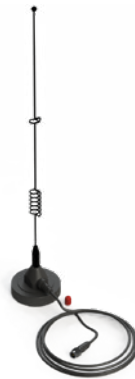
STRIDE whip/straight LTE antenna, magnetic base mount, 9.8ft/3m cable length.