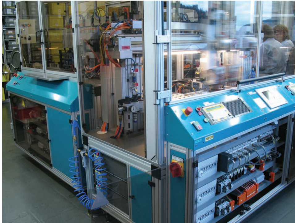
Figure 3: This production cell uses multi-function safety relays to simplify the safety system, cut its cost, and add to its flexibility.

A manufacturer of limit switches upgraded to a multi-function safety relay system for its production cell to accommodate increased automation of the processes used in the construction of its products ( Figure 3 ).