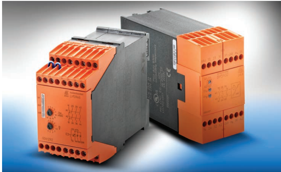
Figure 1: These multi-function safety relays are more capable than single-function safety relays, and less costly and complex than safety-rated PLCs.

Many machines and robots require safety circuits to stop all or part of operation in the event of an emergency. Safety circuits are also used to keep all or part of a machine or robot from running while there is human activity in close proximity, either for normal operations or maintenance.