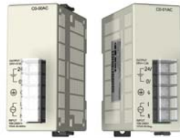
CLICK 24 VDC Power Supply CO-00AC or CO-01AC

Power budget row turns red if maximum allowable power consumption is exceeded for the power supply selected.