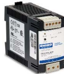
Other 24 VDC Power Supply Example: PSP24-60S