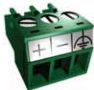
DC Power Connector Part No. EA-MG-DC-CON