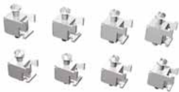
Panel Mounting Clips Part No. EA-MG-BZ2-BRK