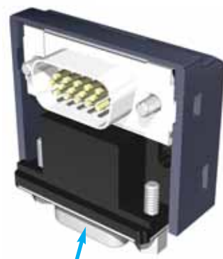
DL06 15-pin high density D-sub port adapter D0-06ADPTR