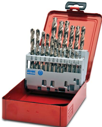
Jobber length drill set 214850 shown

Step and jobber length fractional size drill bits in convenient kits of 3 (step), 21 or 29 (jobber length) pieces.