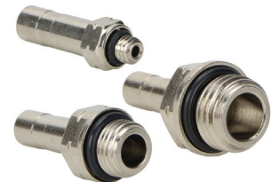
Stem Adapters from $3.25