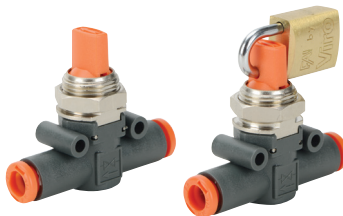
Inline Manual Shutoff Valves from $11.25