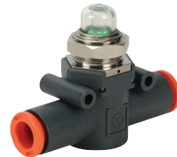
Inline Pressure Indicators from $11.75