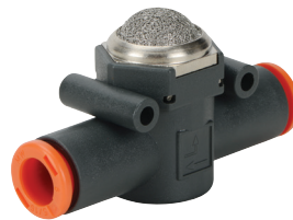
Inline Quick Exhaust Valves from $8.75