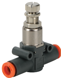
Inline Pressure Regulators from $20.25