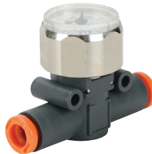
Inline Pressure Gauges from $17.75