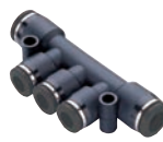
UNION TRIPLE BRANCH NITRA™ Pneumatic Fittings from <---> (5 pack) (U3Bxxx)