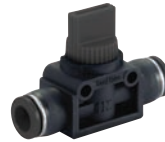
MANUAL HAND VALVE NITRA™ Pneumatic Fittings from <---> (2 pack) (HVUxxx)