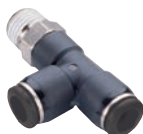
MALE RUN TEE NITRA™ Pneumatic Fittings from <---> (5 pack) (MRTxxx)