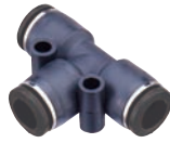
UNION TEE NITRA™ Pneumatic Fittings from <---> (5 pack) (UTxxx)