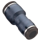
UNION REDUCER NITRA™ Pneumatic Fittings from <---> (5 pack) (URxxx)