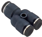
UNION Y REDUCER NITRA™ Pneumatic Fittings from <---> (5 pack) (URYxxx)