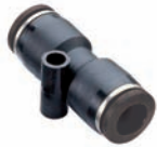
UNION STRAIGHT NITRA™ Pneumatic Fittings from <---> (5 pack) (USxxx)

A variety of fittings are available including: