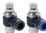
ELBOW METER-OUT NITRA™ Flow Control Valve from <---> (2 pack) (FVSxxx)