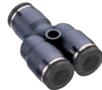
UNION Y NITRA™ Pneumatic Fittings from <---> (5 pack) (UYxxx)