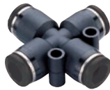
UNION CROSS NITRA™ Pneumatic Fittings from <---> (5 pack) (UXxxx)