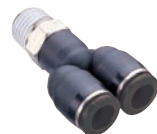
MALE Y NITRA™ Pneumatic Fittings from <---> (5 pack) (MYxxx)