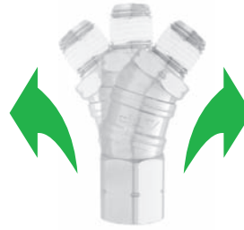
45° Swivel Design