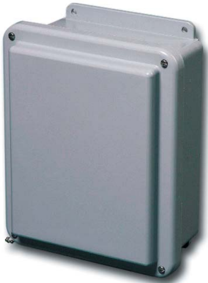
HW-J100805SC Crowned Cover Model Shown