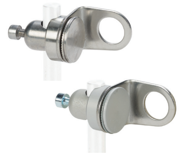
OPT2116 , OPT2117

Note: 304 Stainless steel mounting rods sold separately: OPT2109 (200mm [7.87 in] length), OPT2110 (300mm [11.81 in] length), and OPT2111 (500mm [19.69 in] length).