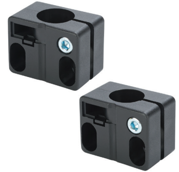
OPT2104 , OPT2105