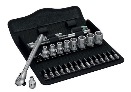
Wera socket set with Zyklop Metal switch lever ratchet, 1/4 inch drive, SAE, 28 pieces. Includes the pieces listed in the table below.