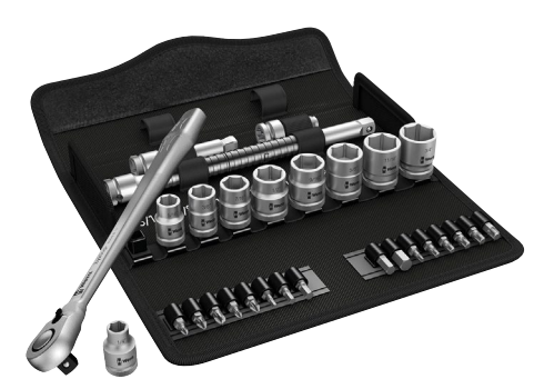
Wera socket set with Zyklop Metal switch lever ratchet, 3/8 inch drive, SAE, 29 pieces. Includes the pieces listed in the table below.