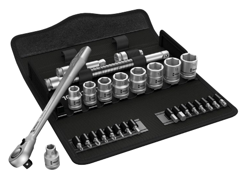
Wera socket set with Zyklop Metal switch lever ratchet, 3/8 inch drive, metric, 29 pieces. Includes the pieces listed in the table below.