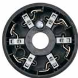
CAGE CLAMP® terminals