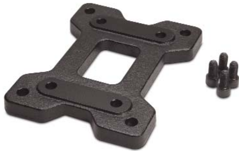
IronHorse Worm Gearbox Mounting Base