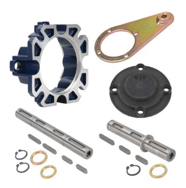
IronHorse Aluminum Worm Gearbox Accessories

Aluminum gearboxes feature hollow-bore outputs (hollow all the way through from one side to the other). These gearboxes also utilize C-face mounting interfaces for trouble-free connections to C-face motors. We also offer optional single and double output shafts, output flanges, torque arms, and output covers.