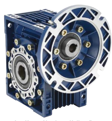
IronHorse Aluminum Hollow Bore Worm Gearbox