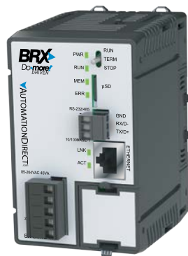
BX-DM1E-M 120–240 VAC

The units have no built-in I/O points. This allows use as a standalone controller unit with no I/O or you can customize the I/O to meet the needs of your application by adding BRX Expansion Modules. All BX ME MPUs can expand their capacity with the addition of as many as eight (8) BRX Expansion Modules, allowing more flexibility while keeping control cost down.