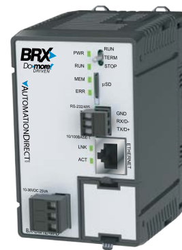
BX-DM1E-M-D 12–24 VDC