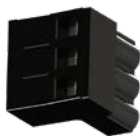
Removable Connector Included ADC Part # BX-RTB03