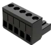
Removable Connector Included ADC Part # BX-RTB05