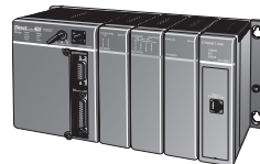
DL405 CPUs Two built-in ports D4-430/D4-440; max. baud = 19.2 K Four built-in ports D4-450/D4-454; max. baud = 38.4 K